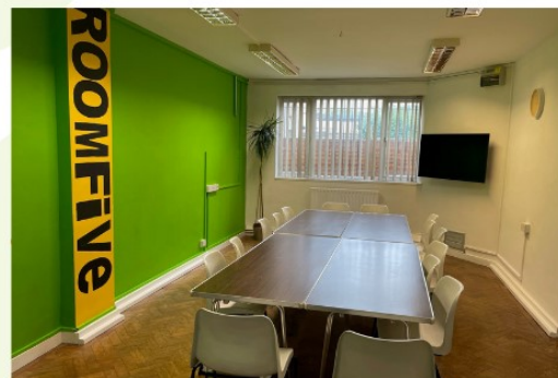
Meeting Room 12 seated